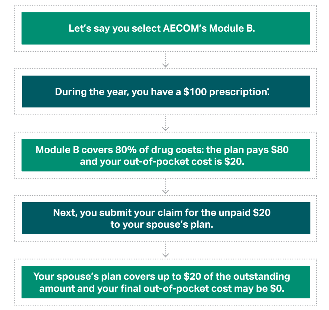
* Equal to the reasonable and customary cost of the expense.

Coordinating benefits with your spouse's health care coverage is a great way to maximize the value of both benefits plans. By coordinating benefits, you and your spouse may be able to have up to 100% of your eligible expenses reimbursed without using your HSA. To do this, you each enrol as dependents in the other's benefits plan, along with your dependent children. Here's how it works: